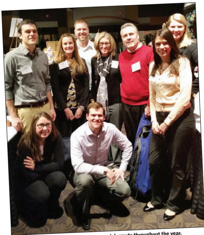
Cintas employees support our special events throughout the year.