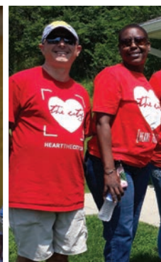
Seven Hills Church landscaped