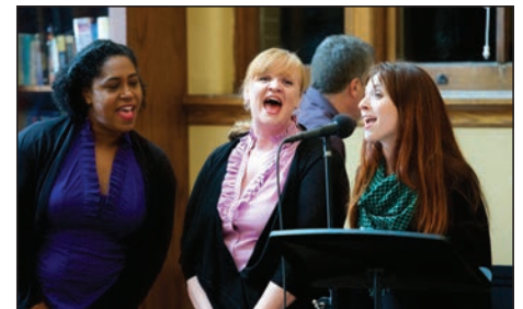
Ensemble Theatre at BHS: Members of Ensemble Theatre Cincinnati perform a vignette from one of their current shows.