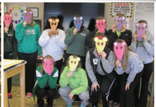
Seton High School students made masks for our Mardi Gras 2015.