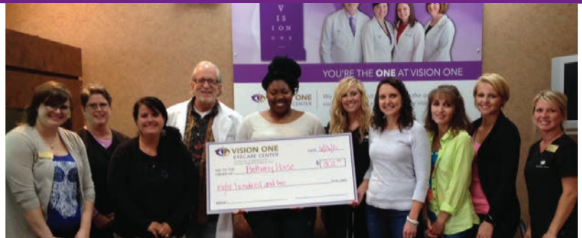
Vision One presents their donation raised during Casual for a Cause Days.