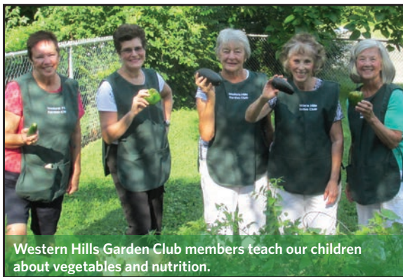
Western Hills Garden Club members teach our children about vegetables and nutrition.

We are very grateful to the Western Hills Garden Club volunteers who have done such a tremendous job for our families this summer, and to the funders who make the Nutrition, Health & Safety program possible: the Charles H. Dater Foundation, the Spaulding Foundation, TJX Foundation, and the General Mills Community Action Council Foundation.