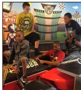
The Indianapolis Children’s Museum was a hit with our children and their parents!

Thanks to the foundations and individuals who funded our summer program. You made it possible for Bethany’s homeless children to create memories that will last a lifetime!