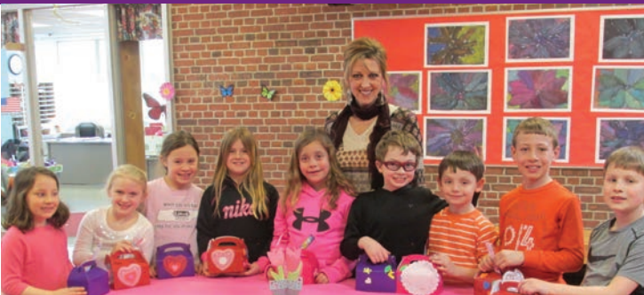
Indian Hill Primary Kids Who Care donated love boxes of personal care and hygiene items.