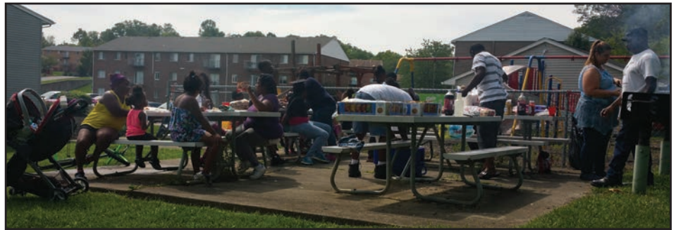
A cookout is just one of the family activities held at Bethany Homes throughout the year.