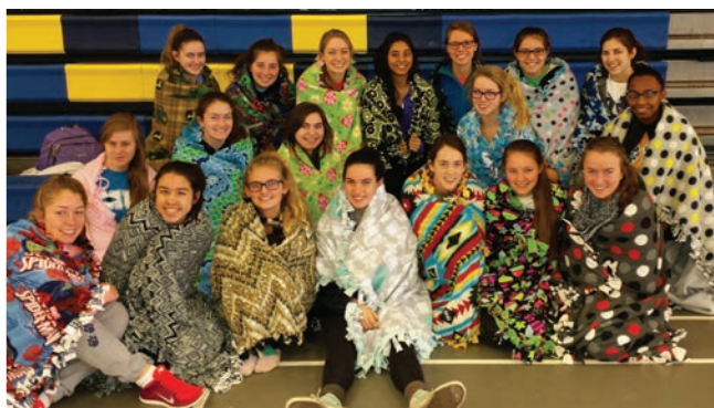
St. Ursula sophomores donated blankets they made to the families at the shelter.