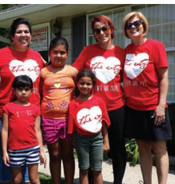
Church Heart of the City volunteers at Bethany Homes apartments.