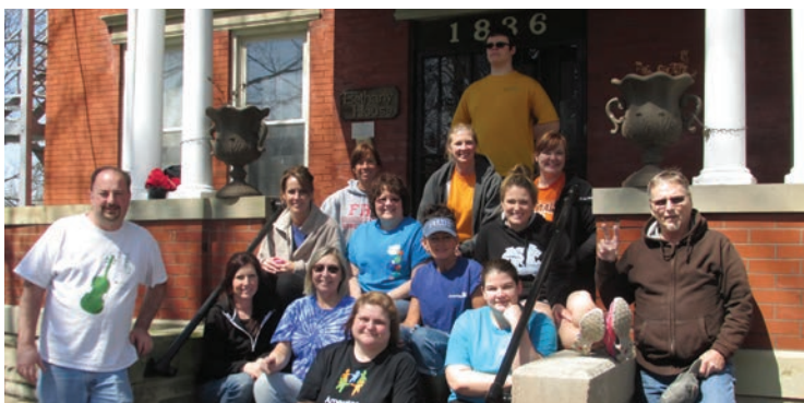
Volunteers from Ameritas painted the 2nd floor of the shelter.