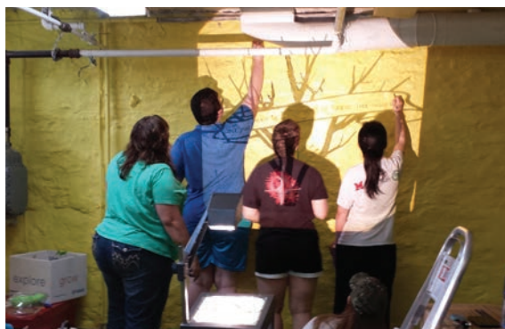
Oaks Hills High School students painted a mural in the children's playroom at the Fairmount shelter.