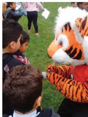
▲ Children enjoy at Safety Fair at Sawyer Point