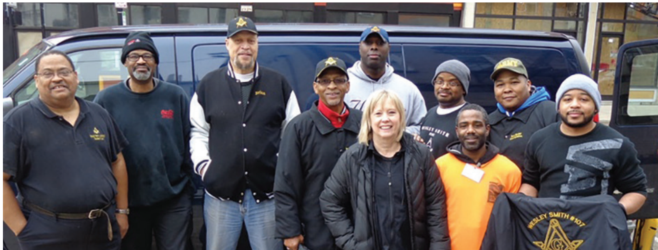
▲ Members of the Wesley Smith Lodge #107 did some extremely "heavy lifting" when they moved furniture and appliances down three flights of stairs at our Main Street shelter.