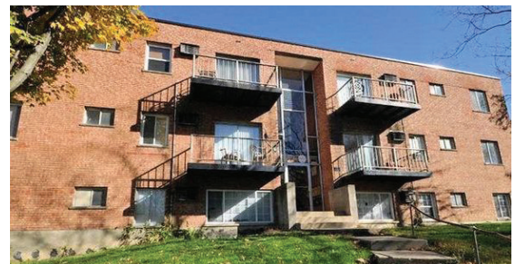
▲ Bethany House relocated families to three apartment buildings just two miles from the Fairmount hub in January of 2016.