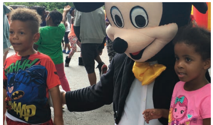
Summertime Fun at Bethany House

P.S. While foundation funding is critical, 99% of the time it is restricted to specific purposes. That is why unrestricted support from individuals is vital to the work of Bethany House—it not only helps to close the gap, it can be used where needed to care for our families.