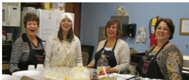
▲ Great friends working cooperatively provide Brunch at the Fairmount Shelter on a Saturday.