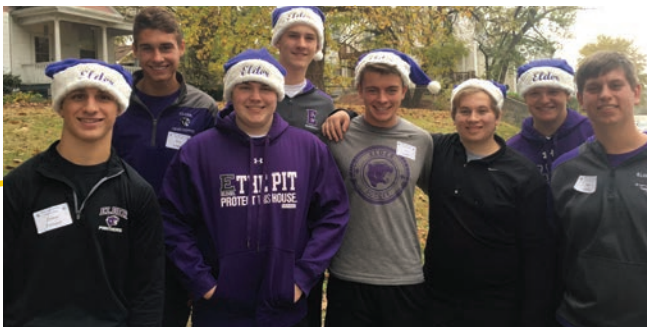
▲ Elder High School students worked on a large mailing for our Holiday appeal.