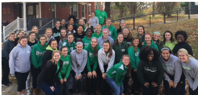
▲ Seton High School's Day of Service - 40 students helped with filing, shredding and sorting donations.