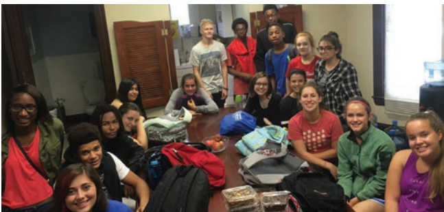
▲ 18 students from Clark Montessori worked diligently to organize donations for our families when they exit shelter.