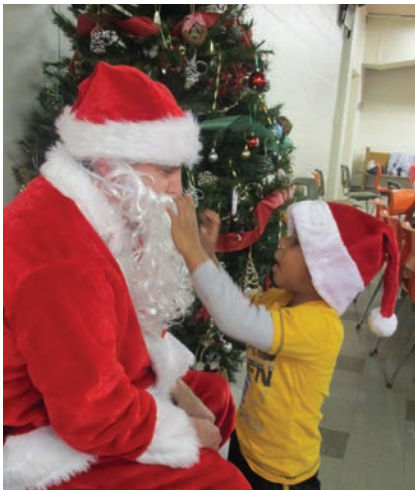
▲ Every child is one caring adult away from being a success story! Sincere thanks to ALL of our Holiday store volunteers, donors, and St. Teresa of Avila for hosting our Christmas Party.