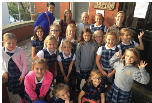
▲ St. Antoninus Brownie Troop spent an afternoon cleaning all the toys in the shelter playroom.