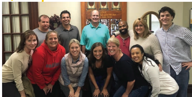
▲ Thank you Kroger volunteers for re-organizing and cleaning our attic. Countless trips to the dumpster and several hours later, our attic was useful again!