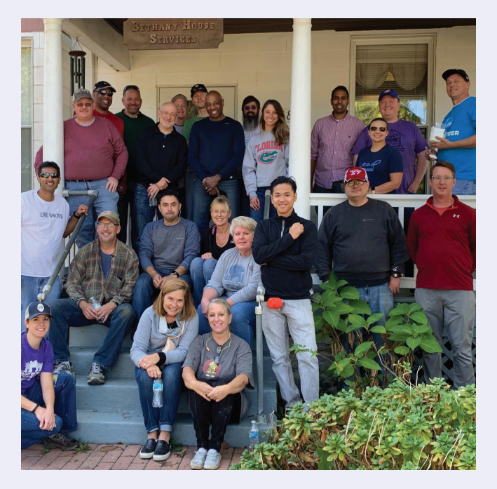
▲ Amazing volunteers from P&G on our front porch steps at Bethany House.

On Tuesday, October 8th, 25 employees from P&G shared their time with Bethany House for one of our biggest cleaning days of the year. These wonderful volunteers worked tirelessly for almost eight hours as they cleaned various areas of the shelter, landscaped around our buildings, painted, trimmed trees and bushes, power washed siding, and everything in between to help beautify our facilities and welcome our guests entering the shelter.