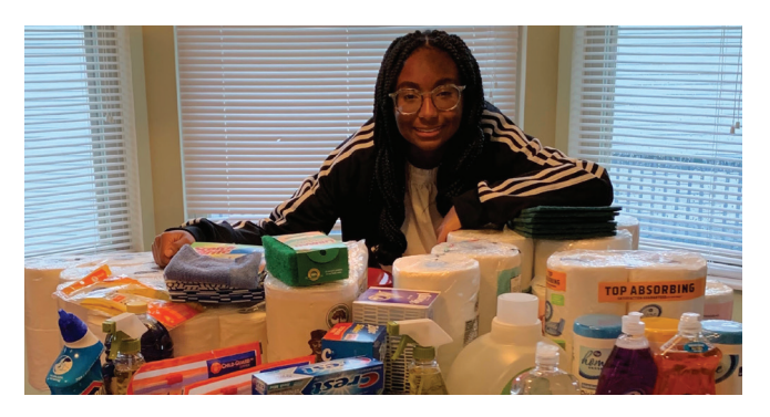
▲ Savoy with the generous donations for Bethany House.