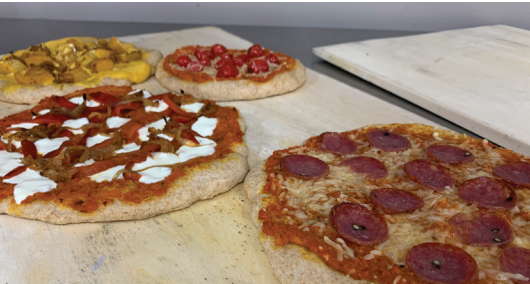
◀ Pizza cooked by the chef.