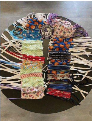
▲ Face masks sewn by MVCA Moms Prayer Group.

Keeping 150-170 people in masks at our five shelters has definitely been a challenge and we are so grateful to all who came to our rescue. Your donations have kept our children and families safe during the pandemic. Thanks to all for sharing your time and talent!