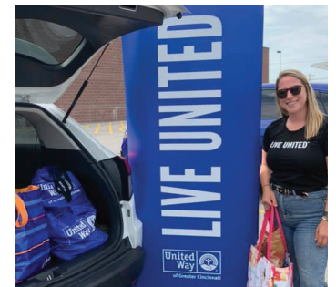
▲ The United Way of Greater Cincinnati helped us by volunteering to provide dinners on three different nights!