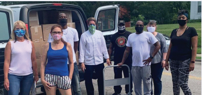
▲ Kroger employees and volunteers dropping off boxes of food to our shelter.