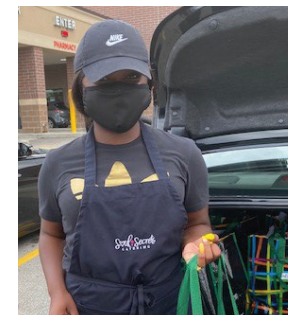
▲ U.S. Bank hired local catering company Soul Secrets to deliver warm meals for our families in July.

If you want to cook or cater a meal for our families, please reach out to our Volunteer Coordinator at info@bhsinc.org or call (513) 557-2411.