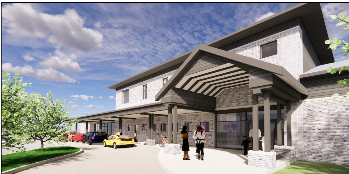
Sketch of new facility