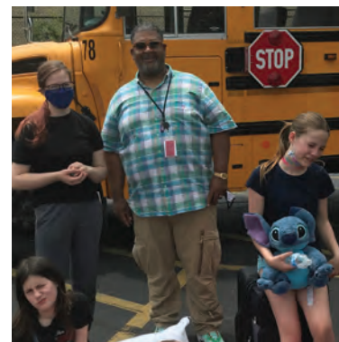
▲ Children and staff ready for a summer field trip.