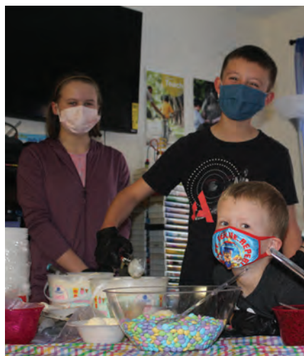
▲ The Gates children enjoyed throwing the party!