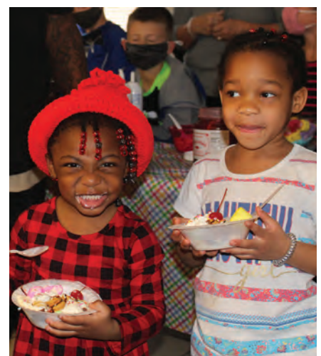
▲ Big smiles and big bowls of ice cream!