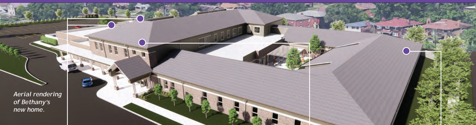
Aerial rendering of Bethany's new home.