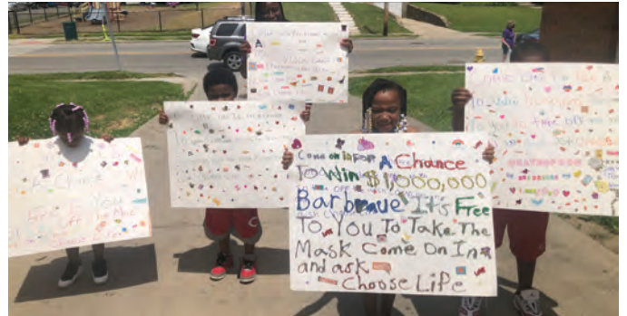
▲ Children made posters telling everyone about the clinic.

Congratulations to the Bethany House's Family Services Department for a fun day and very successful clinic!