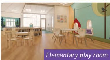
Elementary play room