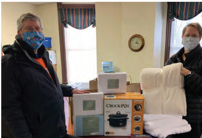
▲ The Hadder family donated slow cookers, cookbooks and sheet sets.