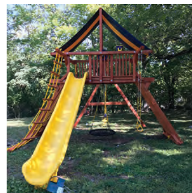
▲ New playground equipment at the Fairmount shelter.