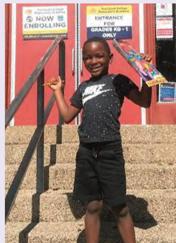
▲ Our client's son shows us that he's going to school too!