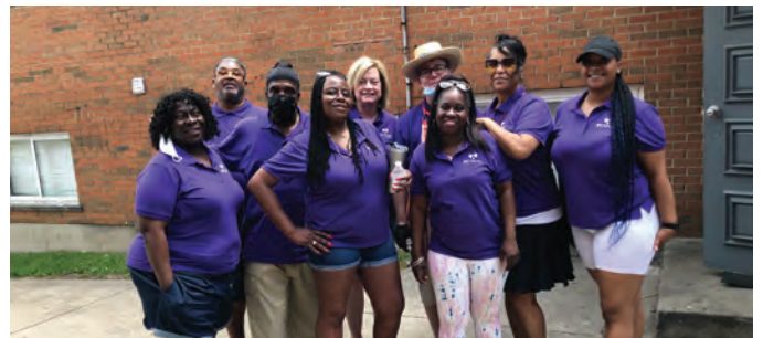
▲ Family Services staff planned the day.