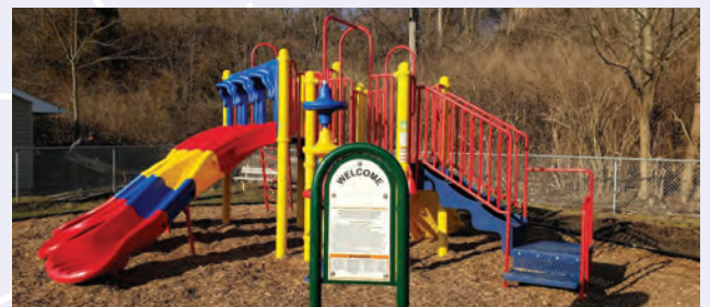
▲ Bethany Homes has a new playground, just in time for summer.

Bethany Homes, Bethany House's 24-unit apartment complex, provides permanent, safe, well maintained, affordable housing for low-income families, most of whom are supported by a single mom. Thanks to U.S. Bank Foundation and the Charles H. Dater Foundation, a new playground was installed just in time for summer!