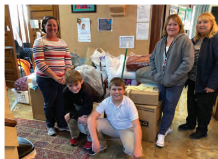
▲ Thanks to these wonderful donors, we have more household goods for our families.

For more information on how you can provide Bethany Basics for our families, please scan the QR code or visit our website: bethanyhouseservices.org