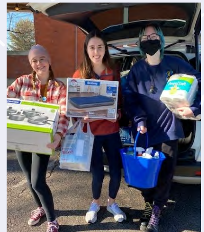
▲ St. Ursula students with donations at our main shelter.

It is always impressive to see high school students giving back to their community. Thank you to the St. Ursula Academy Ohio Junior Classics League who held a donation drive for Bethany House. New, good quality household items when setting up a household, often for the first time, is critical to success. You ladies rocked it!