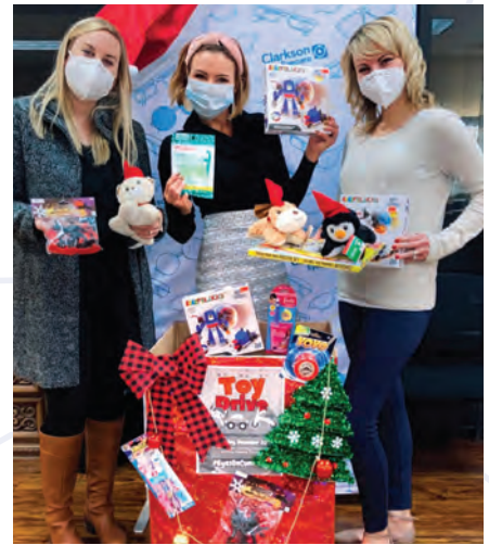
▲ The Clarkson Eye Care Team smiling with donations for our families.