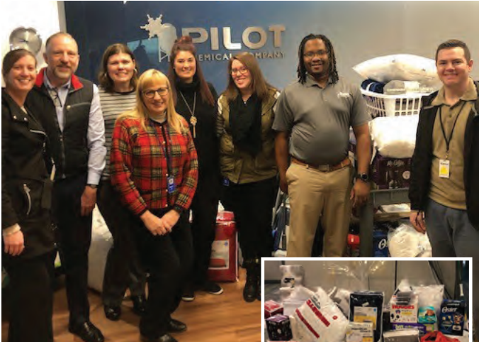
▲ The Pilot Chemical team donating Bethany House basic items.