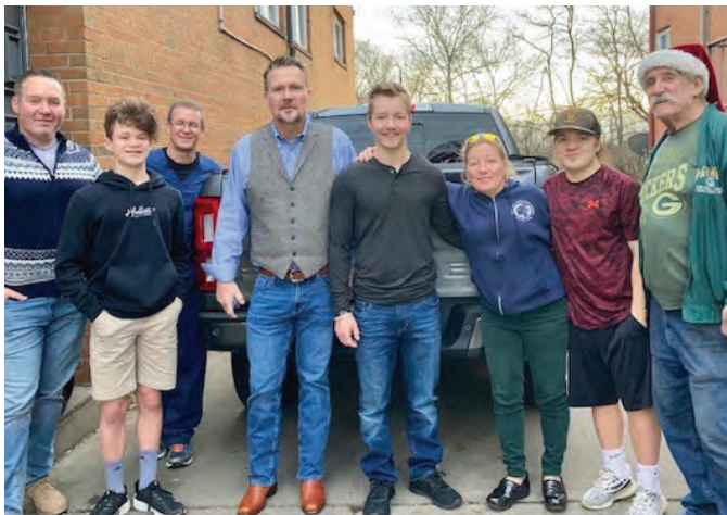
▲ St. Columban Parishioners smiling while bringing donations to our apartment shelters.

Supporters of Bethany House for decades, the parishioners of St. Columban Parish once again collected and donated Christmas gifts for our families. Thanks to the generosity of the parishioners, toys, clothing, household goods and gift cards were delivered to our families for Christmas. Your donations have touched thousands over the years!